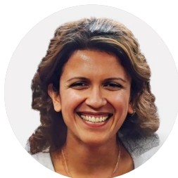
Tania Strauss Head of Food and Water, World Economic Forum, USA